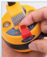
EPIRB keys with protective tab