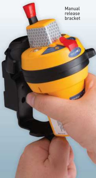
Manual release bracket

A simple protective tab over the operating keys prevents inadvertent activation, yet allows for easy operation when required. The rescueME EPIRB1 also features two high brightness strobes to maximise visibility in low light conditions.