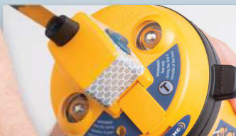
High intensity strobes