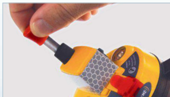
Easily deployed antenna

The retractable antenna provides maximum protection and a reduced outline for stowage. When required the antenna is easily deployed with a gentle pull.